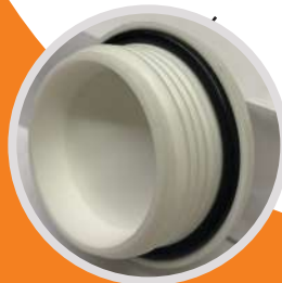
Embedded silicon washer for spill proof fitment