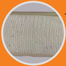
25 mm thickness between walls for better temperature retention