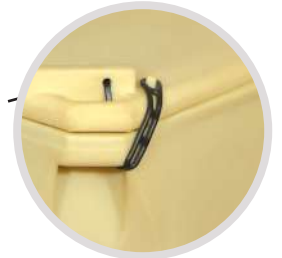
EPDM rubber straps