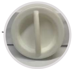
Fully flushed drain cap to avoid breakages