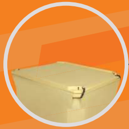
Heavy duty lid