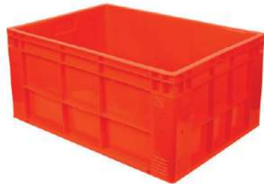
64315 CC Double Wall

Capacity 75 Ltrs OD 650 (L) x 450 (B) x 315 (H) mm ID 610 (L) x 405 (B) x 305 (H) mm